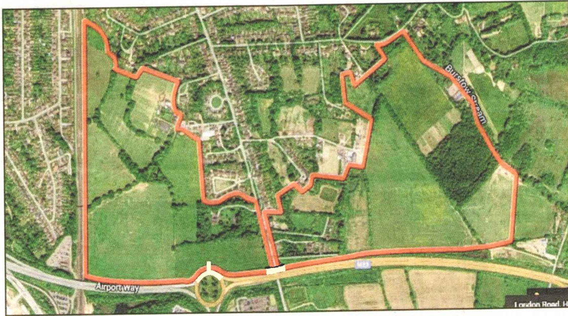
DEVELOPMENT: The area the proposed Horley business park could cover